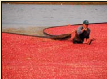
A.D. Makepeace, Cranberry Growers