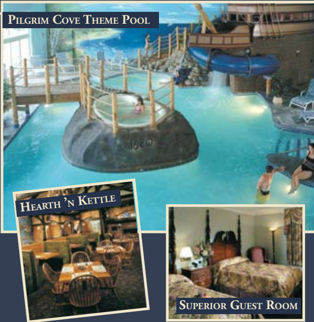
PILGRIM COVE THEME POOL