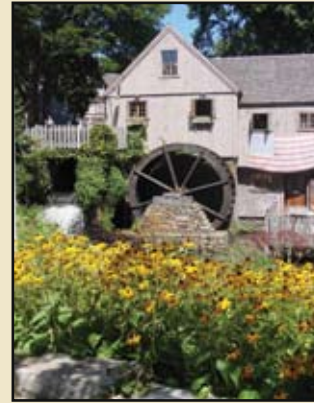
The Jenney Grist Mill